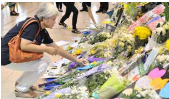
Tribute to Mr. Lee Kuan Yew