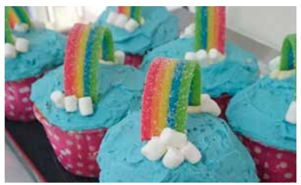
March School Holidays at Youth Centre