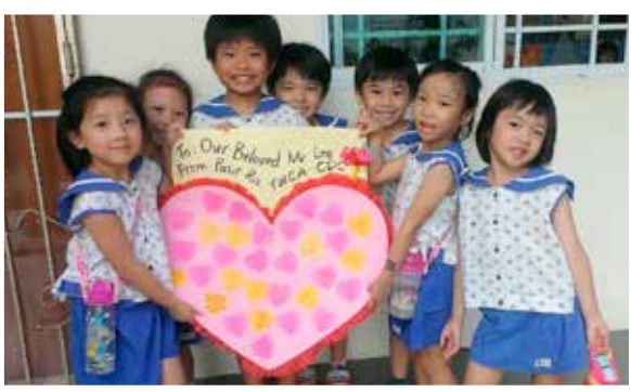
CDCs’ Tributes to Mr. Lee Kuan Yew