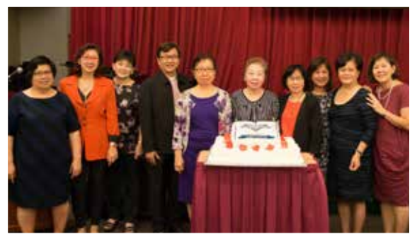
Annual General Meeting 2015